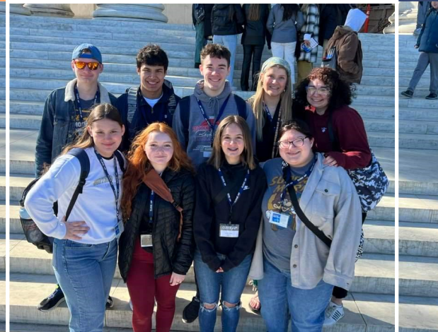
...g 11000 perfor- ...by Townsend ...l students. Nine students Broadwater High l in Washington for the Close-Up m. Below: New tables under the constructed pavil- Holloway Park.