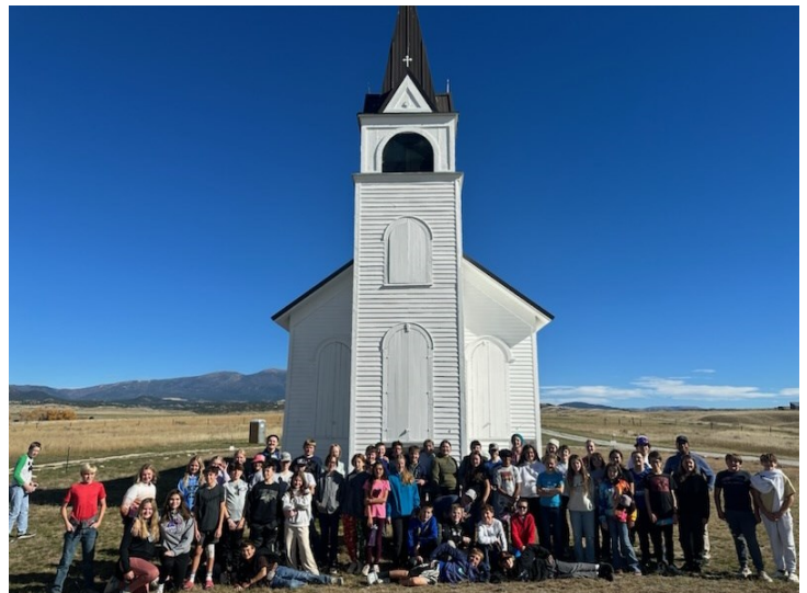
Canton Church hosts Townsend Schools Middle School Students

This winter we will work on putting together the slate of summer events for June, July, and August 2024. We hope to see everyone at the Canton Church this summer.