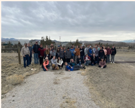
Townsend 7th Grade Class Visiting the historic Radersburg Cemetery