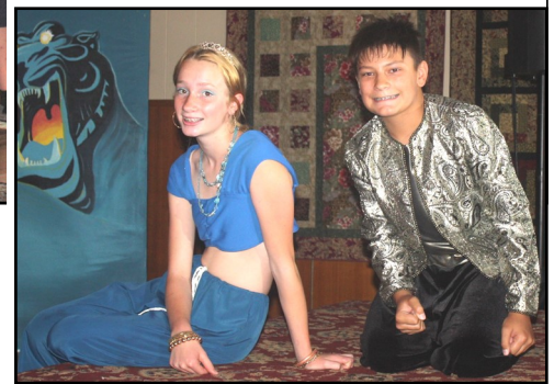
Above: The Ryland KM Foote Memorial Trust received $2,000 in BCF grant funds to purchase a sound system. The very first performance using the sound system was Aladdin which starred local student talent. Left: The Broadwater County Mental Health Local Advisory Council receiving their $3,000 grant check from BCF for their peer support and public outreach and education programs.