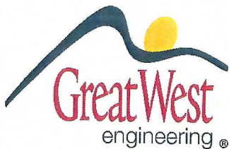
EXHIBIT "A" SPECIFIC TASK ORDERS