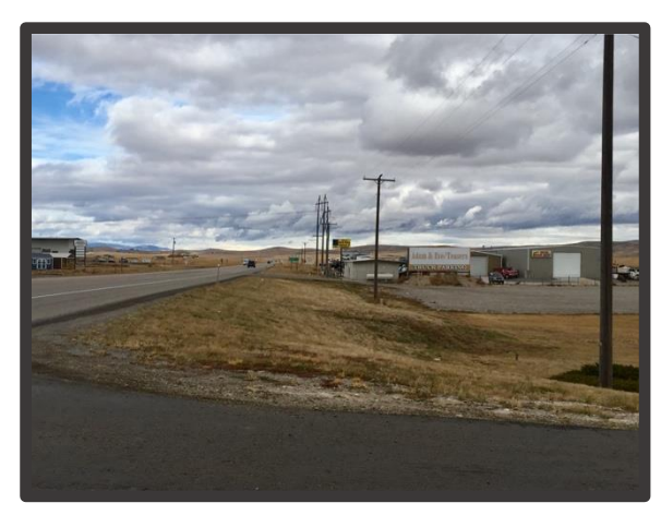
Figure 7. Looking north on Highway 287

Canyon by Willow Creek at a significant cost. An alternative might be an energy grid