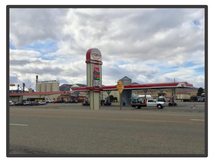
Figure 1. Wheatland Area of Broadwater County

STATEMENT OF INFRASTRUCTURE DEFICIENCY IN THE INDUSTRIAL AND COMMERCIAL AREA OF THE WHEATLAND CENSUS DESIGNATED PLACE (CDP) BROADWATER COUNTY