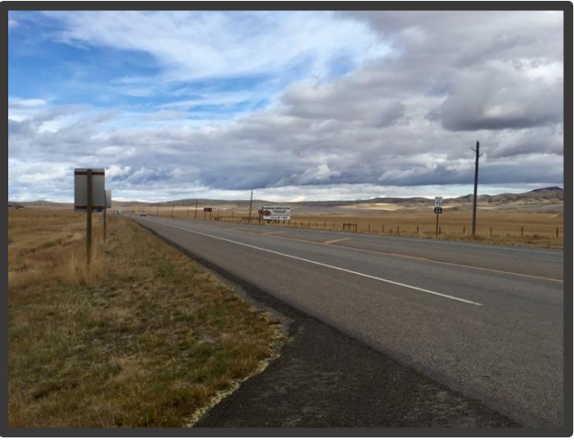
Figure 6. Highway 287, north of the I-90 Interchange

Highway 287 – Highway 287 is currently constructed with three lanes, two traffic lanes and a center turn lane, with paved shoulders on both sides. As the Wheatland area develops over time, this highway design may become inadequate. Design upgrades might include acceleration / deceleration lanes, additional traffic lanes, traffic control devices at strategic locations, pedestrian facilities, pedestrian crossing control devices, and/or lighting.