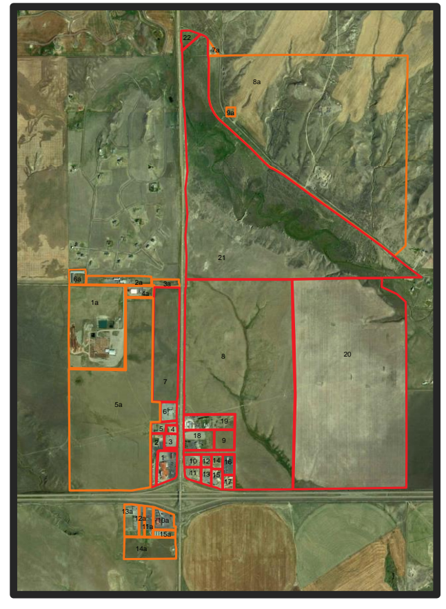
Figure 2 Wheatland Industrial and Commercial Area (draft map – red lines (does not include orange lines))

The Wheatland industrial and commercial area, comprised of nearly 1,000 acres, is generally located along US Highway 287, just north of the Interstate 90 – Highway 287 intersection (Figure 2). It includes the Wheat Montana Bakery and the proposed site of Bridger Brewing, both valueadding businesses. The creation of a TEDD will