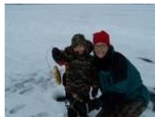
January Perch Derby