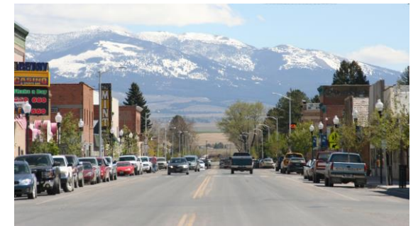
Looking East on Broadway